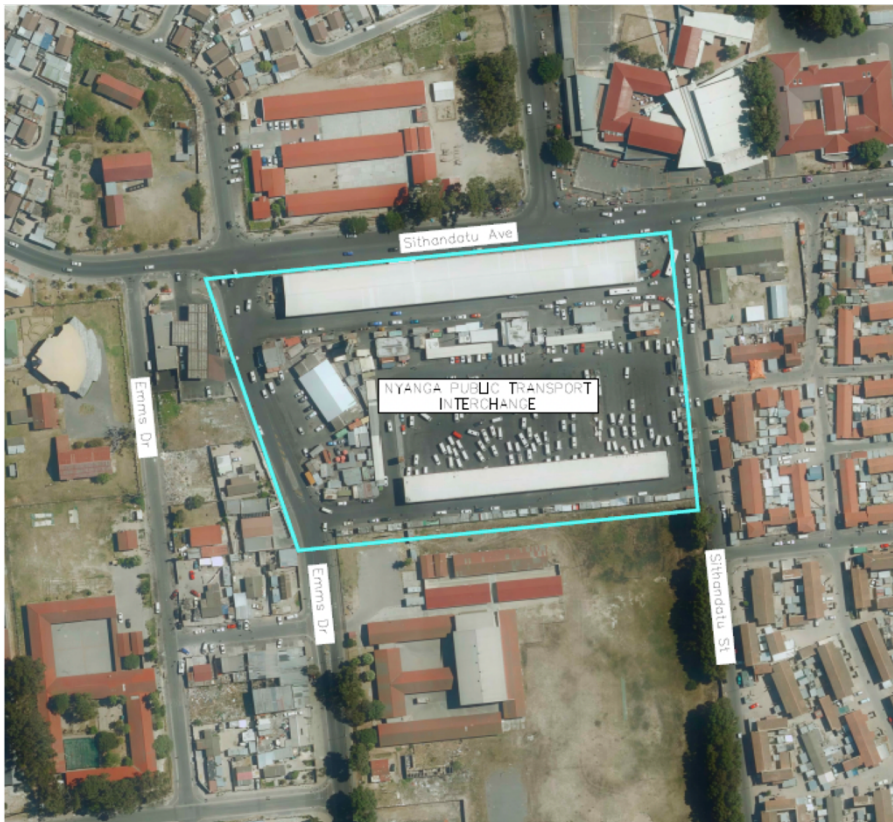
LOCALITY PLAN OF THE SITE

CITY OF CAPE TOWN URBAN MOBILITY DIRECTORATE: TRANSPORT INFRASTRUCTURE IMPLEMENTATION CONTRACT NO. 190Q/2023/24 UPGRADE OF NYANGA PUBLIC TRANSPORT INTERCHANGE